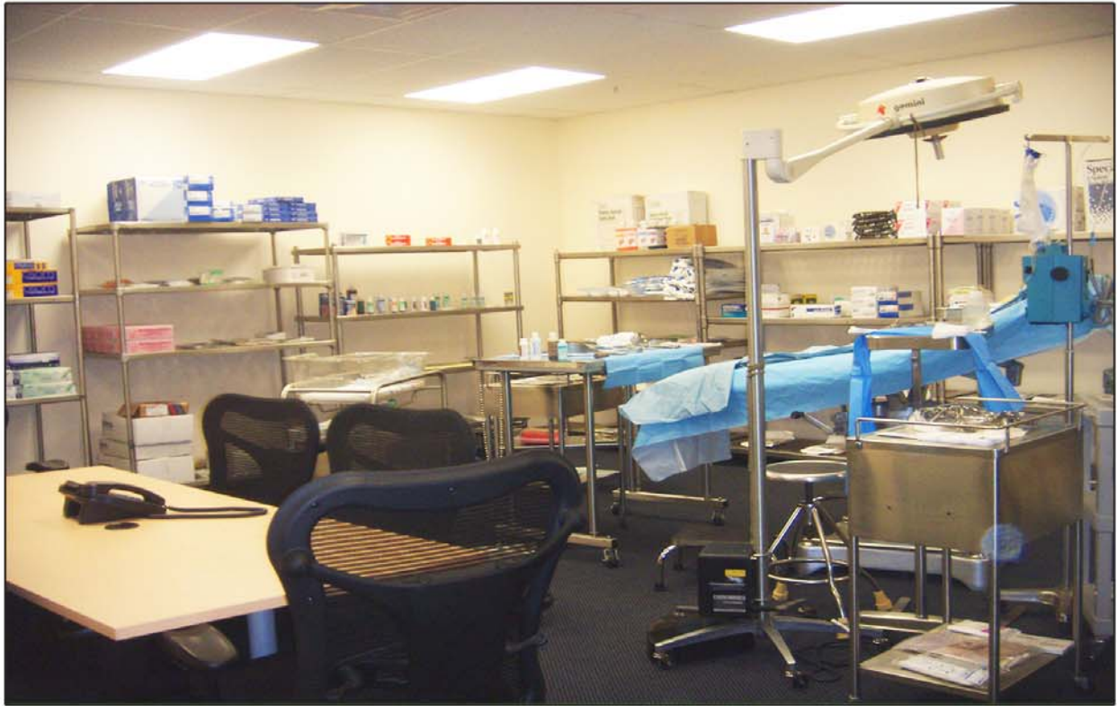
PRGD's Training Center Is Equipped With an Operating Room to Promote Interactive Marketing Programs with Hospital Purchasing Staff.