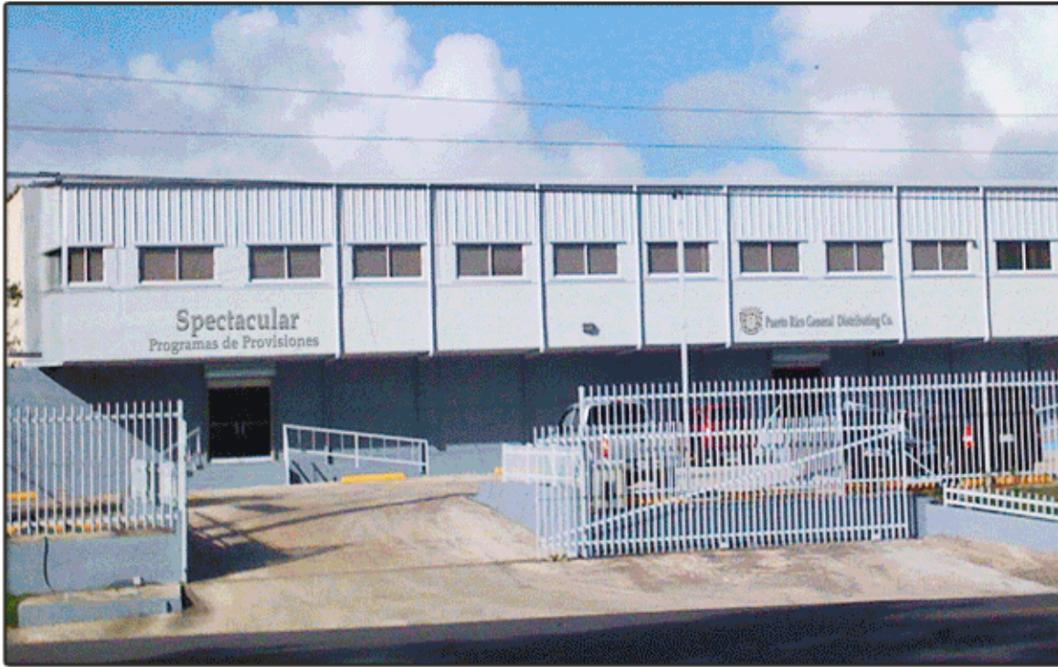
PRGD's Office and Warehouse Facilities with Over 50,000 Square Feet.