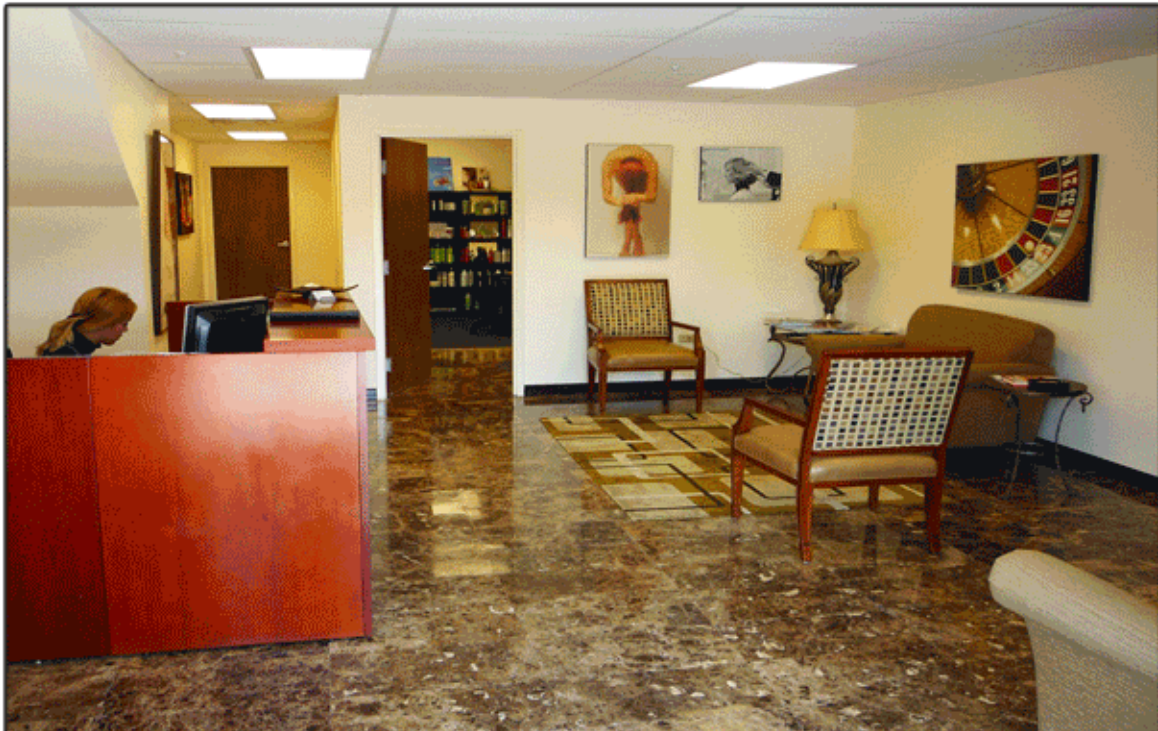
PRGD Reception Area. We Welcome You to Puerto Rico.